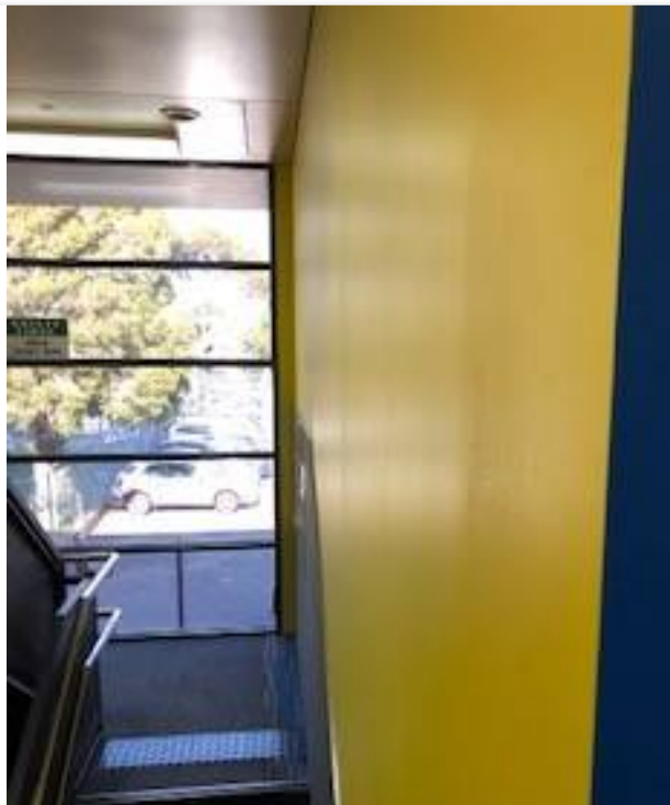
Freshly painted walls!