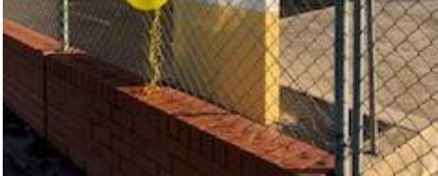
Welcome Back Everyone!