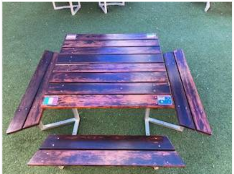
Our canteen tables after....