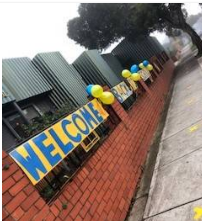
Welcome Back Everyone!