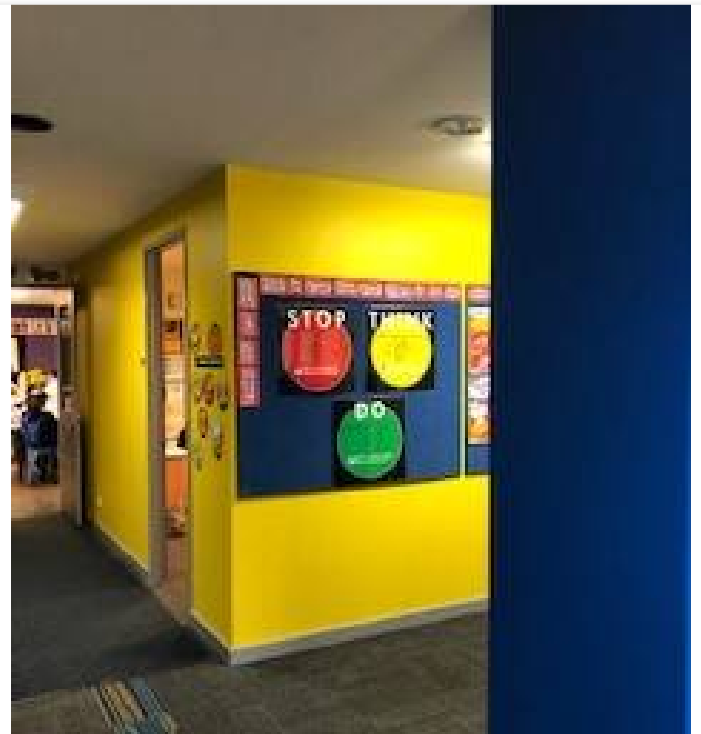
Freshly painted walls!