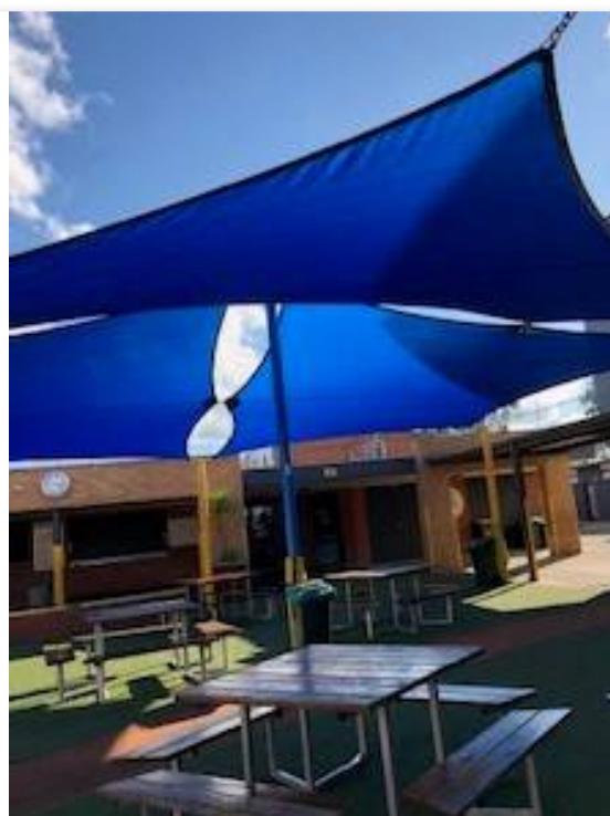
New Shade Cloths!