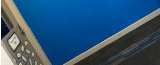
Freshly painted walls!