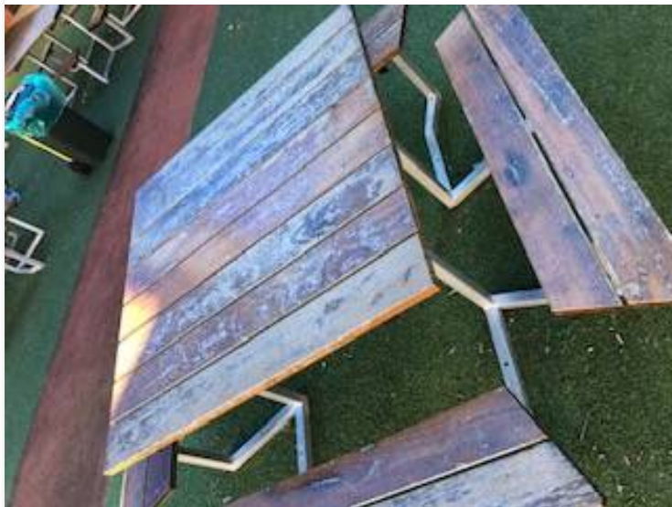
Our canteen tables before....