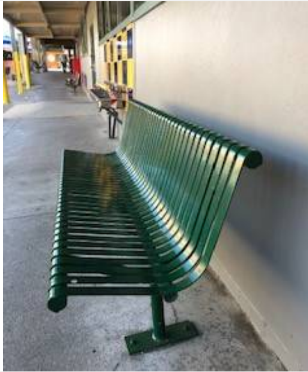
Freshly painted seats!