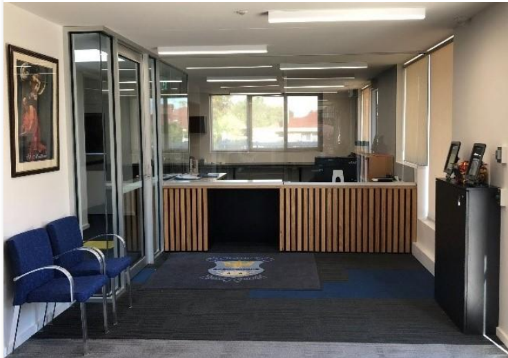
Our new Reception Area