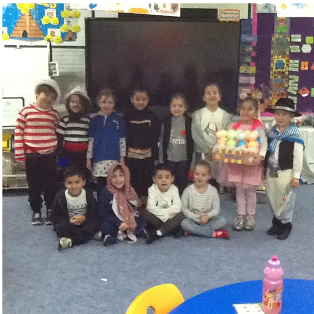
Prep GP getting ready for the parade