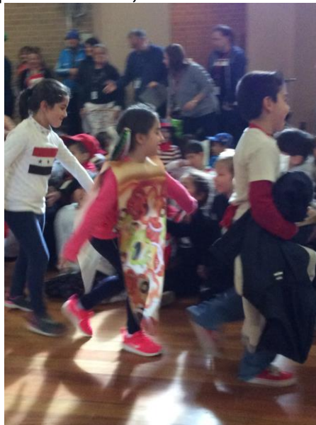
A new type of Pizza, Pizza Juliana